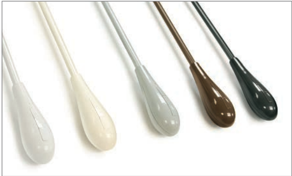
White, beige, gray, bronze, or black wands